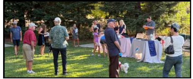
Welcome Event - Hillcrest Pool - September 11, 2025