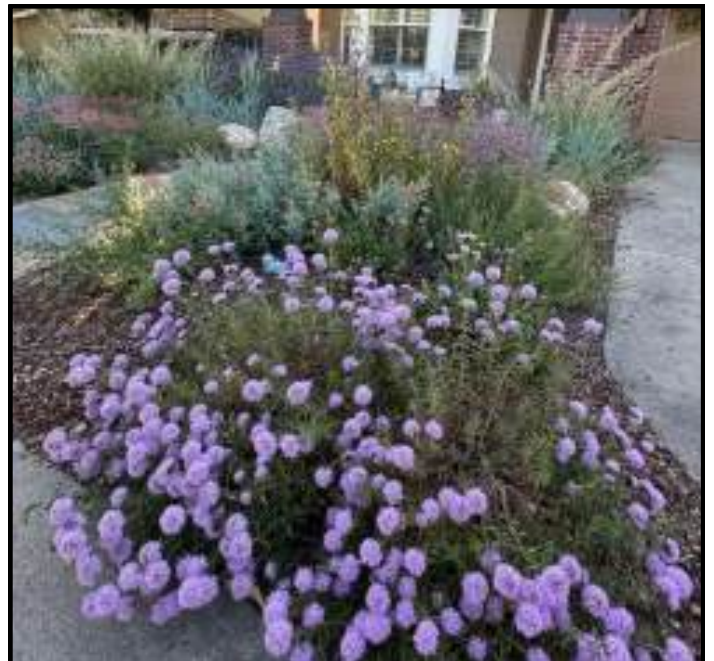
Mallow Root Design, Miridae Mobile Nursery and Terrain California native plants fill this Whitney Oaks yard created by Creations.

If you are interested, please contact our Community Managers for more information and volunteer requirements.