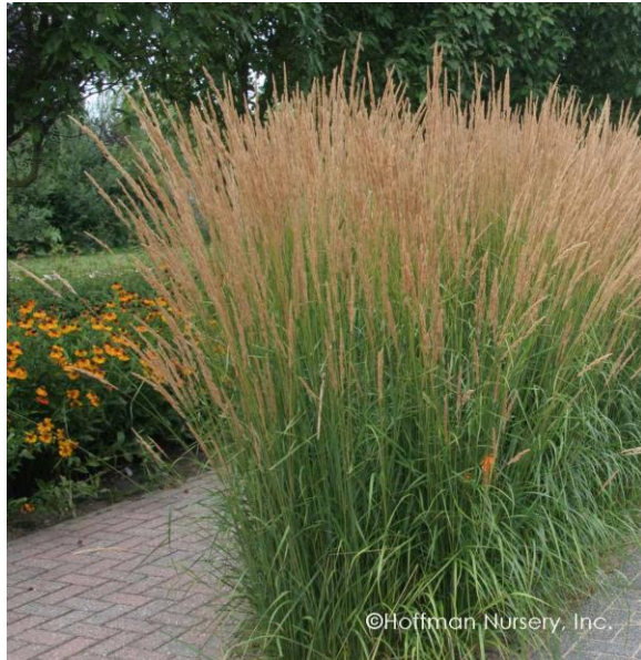
Karl Foerster Feather Reed Grass