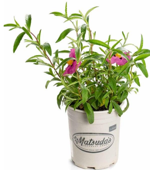
Cistus Orchid RockRose