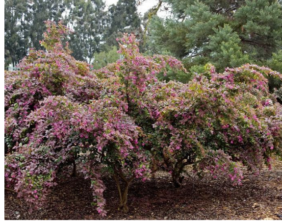
Razzleberri® Fringe Flower