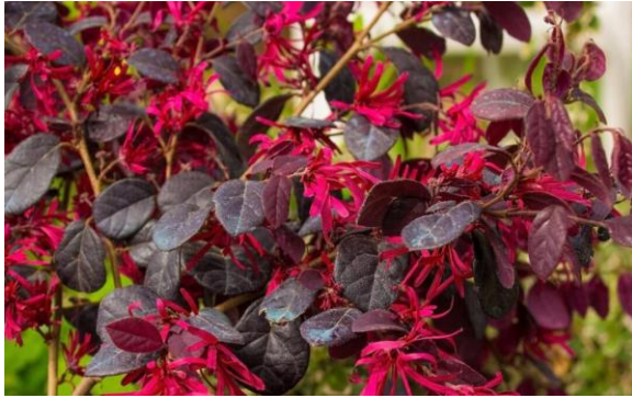
Loropetalum 'Purple Majesty'