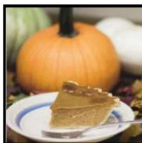
Pumpkin or Pumpkin-Pecan $24 (thaw & serve)