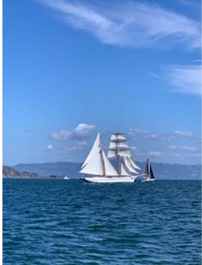
Photo: Matthew Turner Tall Ship spotted while sailing on the SF Bay Sept. 2021