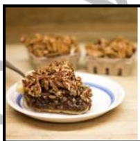
Pecan $24 (thaw & serve)