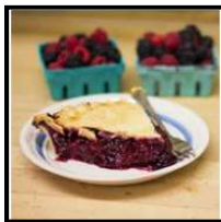
Razzleberry $23 (thaw & bake)