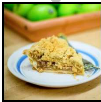
Dutch Apple $24 (thaw & serve)