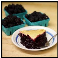
Marionberry $23 (thaw & bake)

Pie orders are due by the end of the month (however early ordering is helpful to keep things organized!)