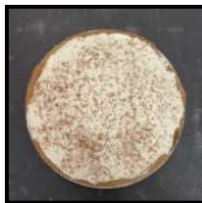
Chocolate Truffle Cream $28 (thaw & serve)