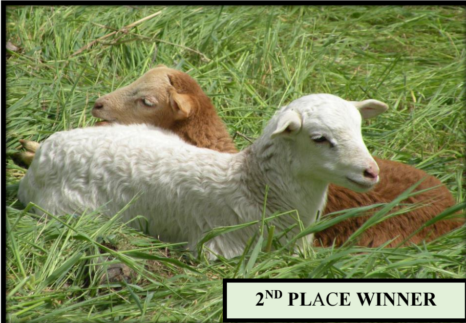
2 ND PLACE WINNER