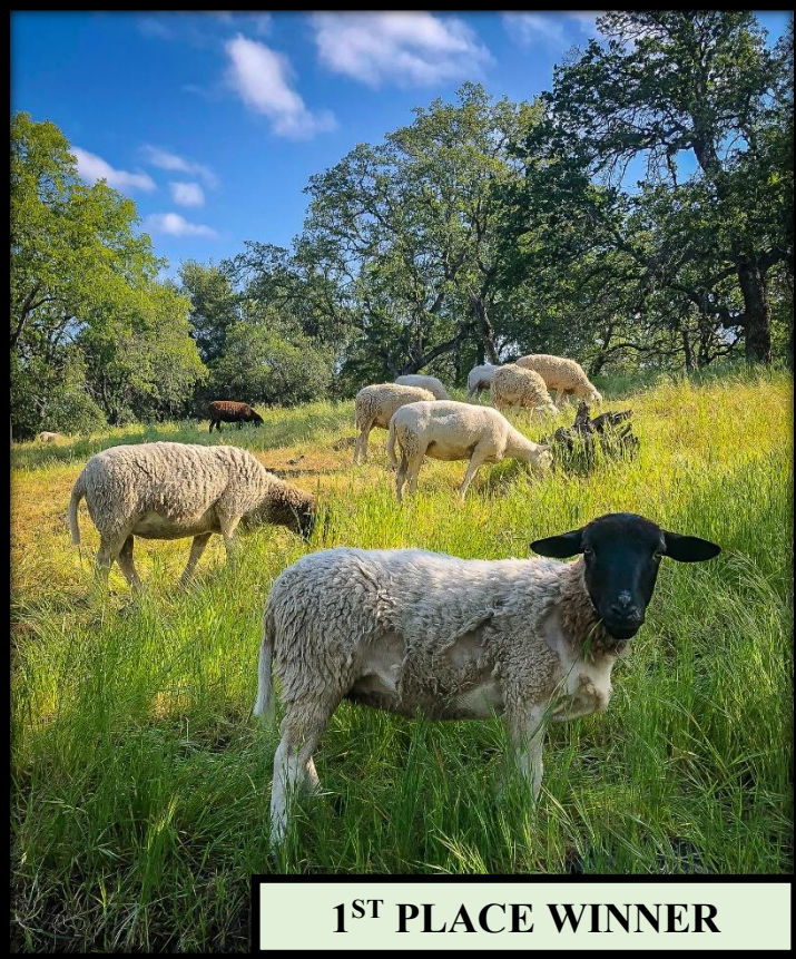
1 ST PLACE WINNER